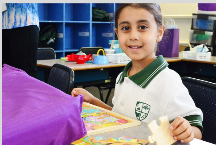
A glance at our Preps' first day!