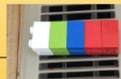
Izzy Prep B