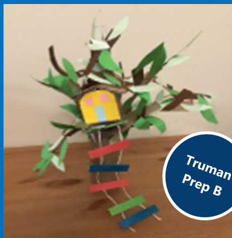
Truman Prep B